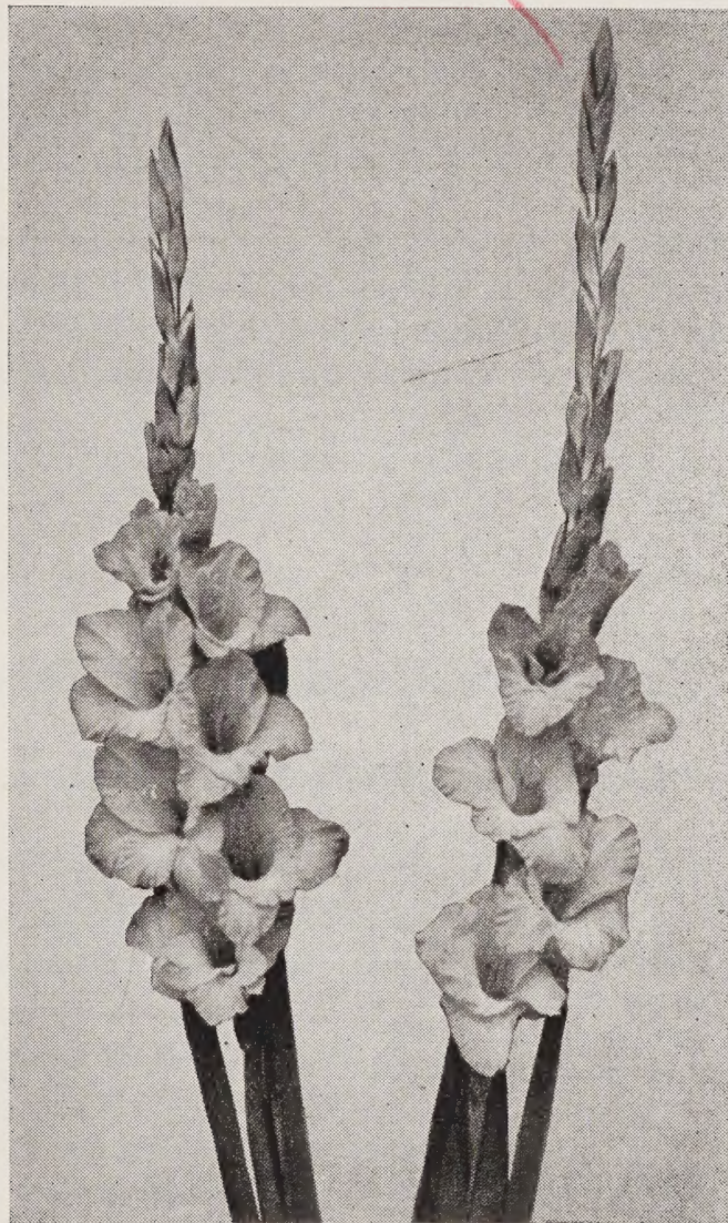
SPIC AND SPAN